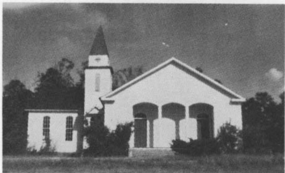
St. Luke's Church Renovations and Additions 1915