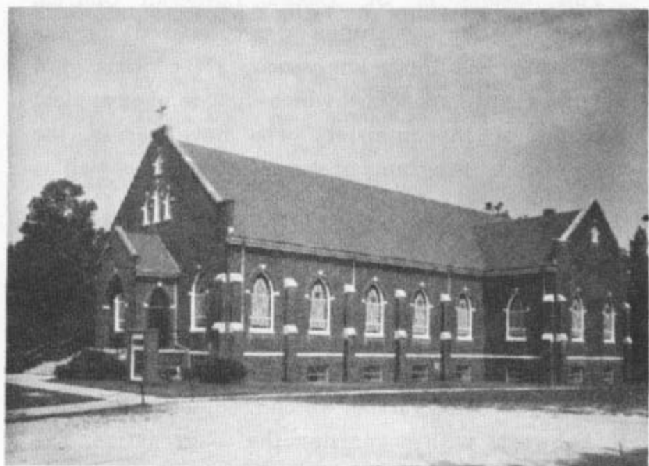
St. Luke's Lutheran Church Built 1955